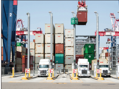
Trucks wait to be loaded with cargo at the port in Long Beach, Calif., in 2017.